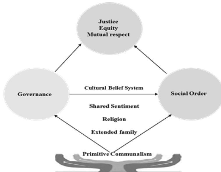
Fig. 2: How Governance Enables Social Order in Traditional Societies

economy approach, dispensed nothing less than a people-centred government. By extension, when the dominant behaviour of governance is people oriented, minimal social shocks were experienced in the pre-colonial traditional societies and social order was easily achieved. In other words, the traditional governance system functioned in more democratic terms even though it has been described as rudimentary in nature. Fig. 2 below shows how governance enabled social order in traditional societies.