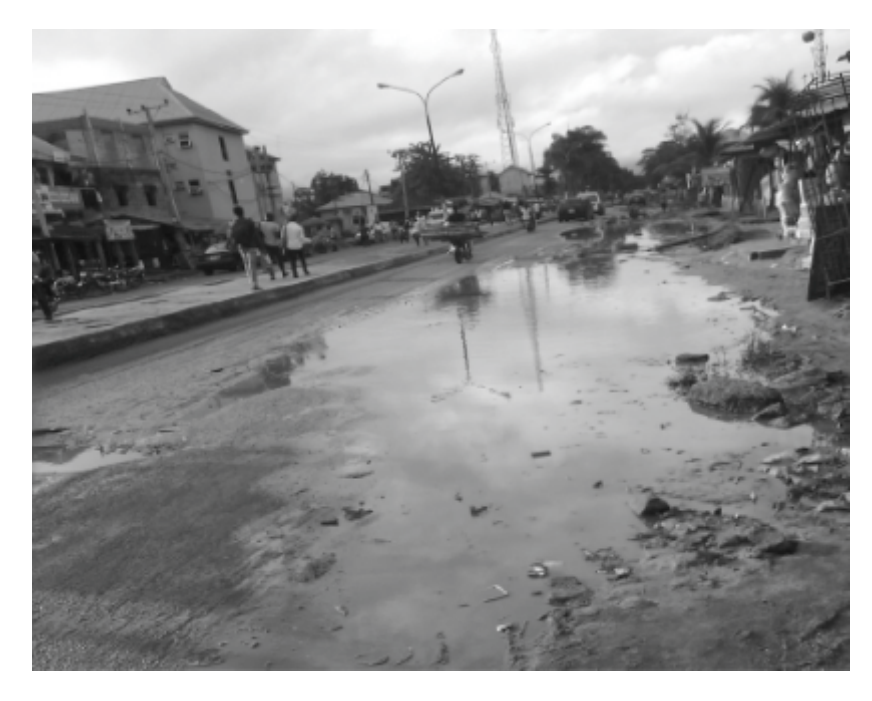
Plate 3: Showing One of the Bad Spots on the Nekede New Road, Road

Plate 2: Showing the State of Road Near Polytechnic-FUTO Road Junction