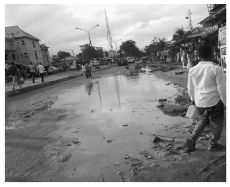
Plate 4: Part of the Deplorable Road in Nekede