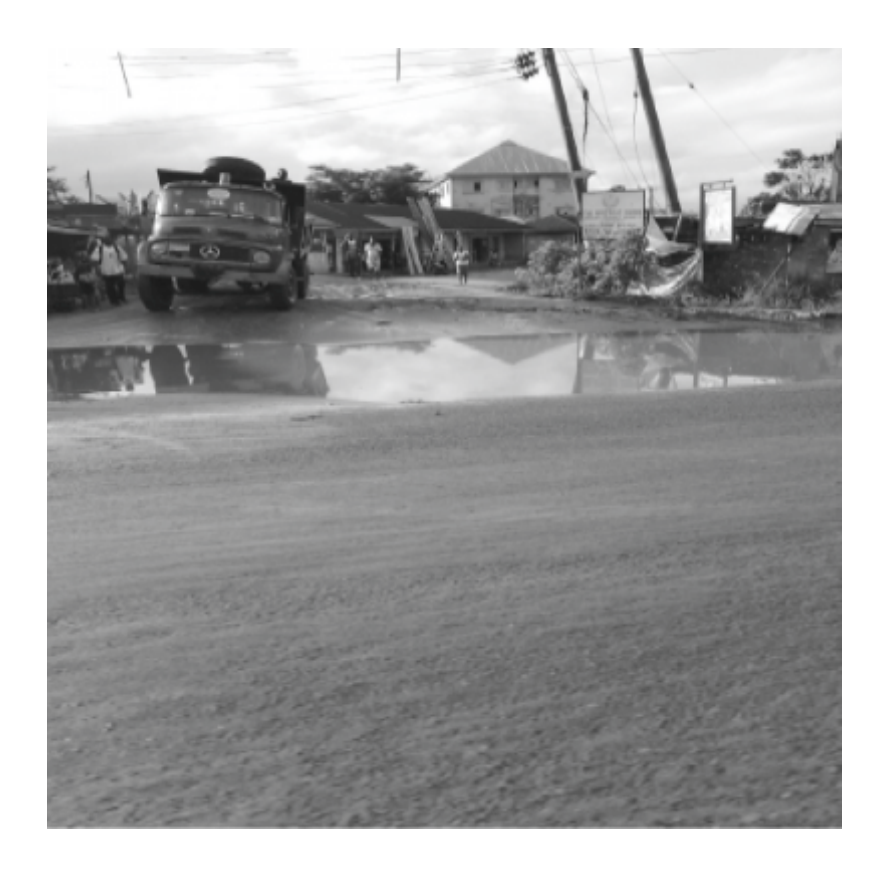
Plate 6: Showing Part of the Umuofocha/Umuokomoche to Owerri Road