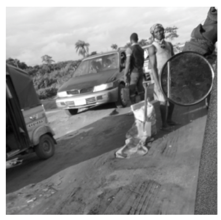
Plate 5: Some Volunteers Trying to Salvage Some of the Bad Spots on the Road