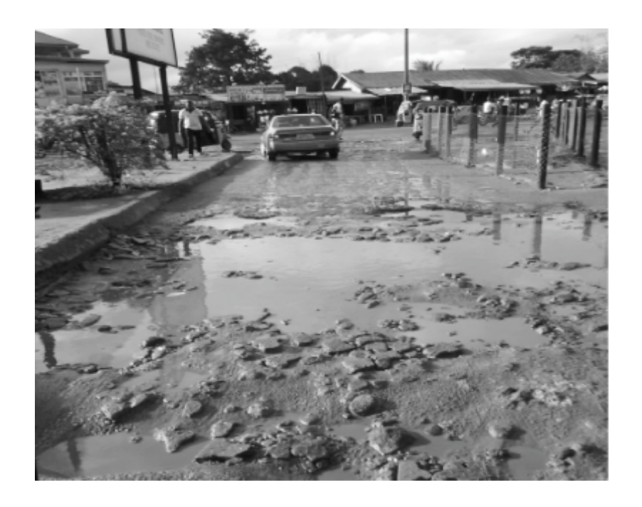
Plate 2: Showing the State of Road Near Polytechnic-FUTO Road Junction