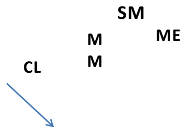
Figure 1. Photomicrograph of Colon of two months old albino rat showing Crypt of Lieberkuhn (CL). Note the absence of crypt fission. Muscularis mucosa (MM), submucosa (SM) and muscularis externa (ME). Arrows show the simple columnar epithelium of the Crypts. H & E X250.