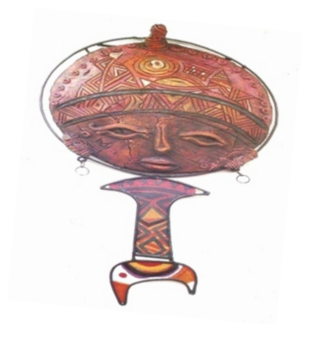
Fig. 5: Chukz Okonkwo, Weaver Song, wood and metal 43cm x 92cm © Osita Williams 2019.