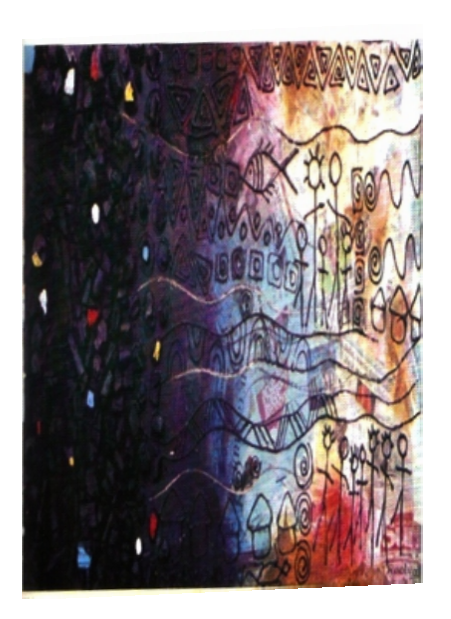
Fig. 1: Uche Joel Cima, Manuscript, Mixed media © Osita Williams 2019

However, visual arts play complimentary role to culture in every organized society. It facilitates the effective existence of culture and culture on the other hand provides a suitable playground for massive existence of visual arts. The study shares the view that visual arts promotes culture and both work together to achieve a common goal ---- harmonious, educated and effective existence of the society.