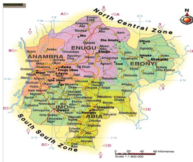
Fig.2. States of South East Nigeria