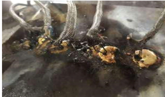
Fig 2: Thermocouple wires connected to the specimen.

The test specimen is prepared from C 45 steel-6mm thick, 150 mm long and 135 mm wide. Bead on plate technique was used for the present purpose. A centreline was marked along length of workpiece. Five holes (6mm diameter and 3mm deep) were then drilled at progressively increasing distance from marked centreline. Thermocouple wires were then fused at their hot junction to a fine spot with the help of a soft carbon arc as shown in figure 2. These spotted hot junctions were then brazed in the drilled holes by using oxyacetylene gas frame as shown in figure 2