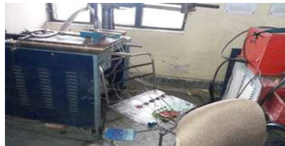
Fig 3: The complete welding set up

The prepared specimen was placed on welding fixture such that the bottom side of weld piece is roughly 80mm above weld table to facilitate space for thermocouple bar as shown in figure. The cold junction of these thermocouple wires was connected to five channels temperature logging system as shown in figure 3 which was developed using Arduino board. The output from this control board was connected to a monitor screen to record real time temperature data from the welding.