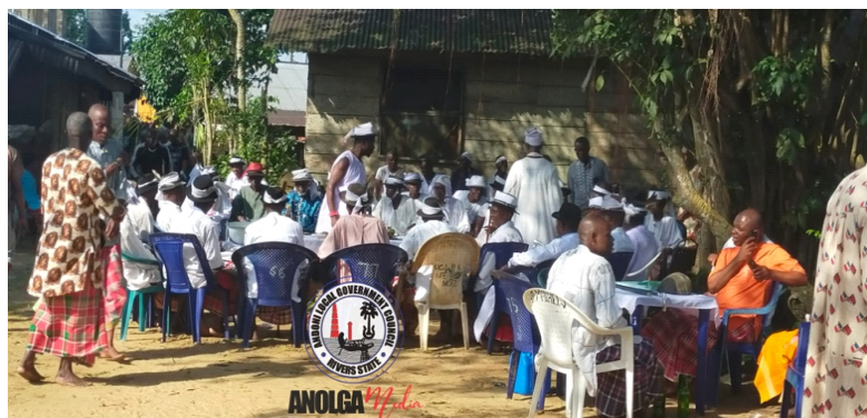
Figure 8: Some Chiefs and Elders performing their respective Rites/Roles during the Oath-Taking Rituals