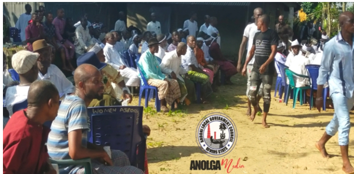
Figure 9: The Repentant Youths taking turn during the Oath-Taking Ritual at Andoni Ancestral square