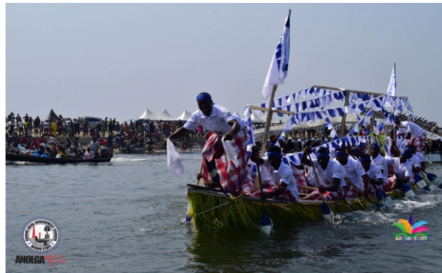
Figure 13: Boat Regatta during Andoni Carnival/Festival on the return of peace in the LGA after Oath-Taking Ceremony promoting the culture heritage peaceful co-existence of the people