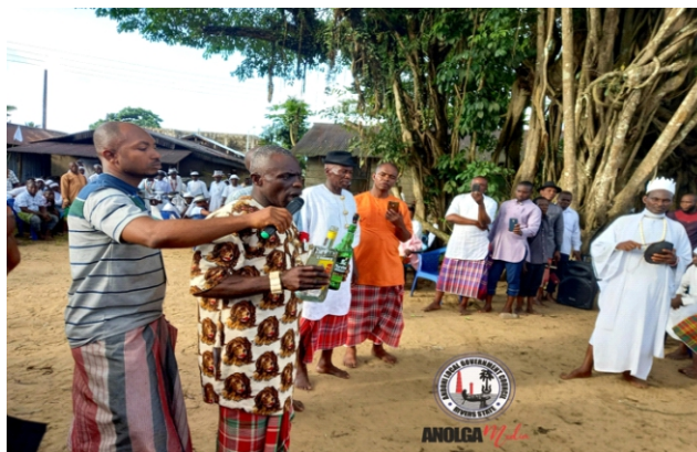
Figure 5: The Chief Custodian of Andoni Deities Performing some Rites before the Oath-Taking by the concerned/repentant youths