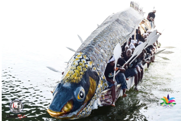
Figure 12: Boat Regatta during Andoni Carnival/Festival on the return of peace in the LGA after Oath-Taking show casing of the best Art works in the Area.