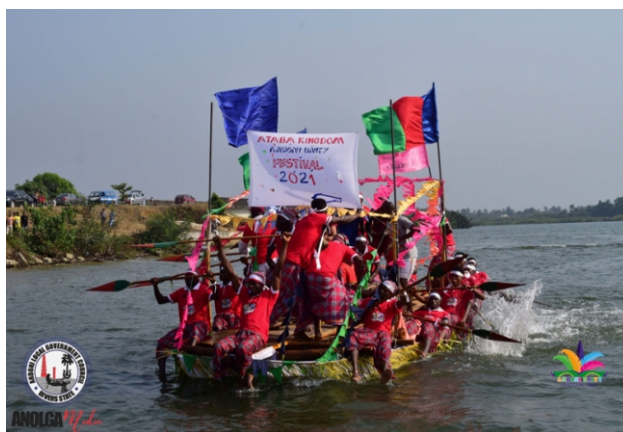
Figure 10: Boat Regatta during Andoni Carnival/Festival on the return of peace in the LGA after Oath-Taking Ceremony