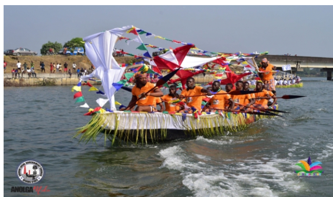
Figure 11: Boat Regatta during Andoni Carnival/Festival on the return of peace in the LGA after Oath-Taking Ceremony reinforcing the importance of peace in the overall well-being of the people