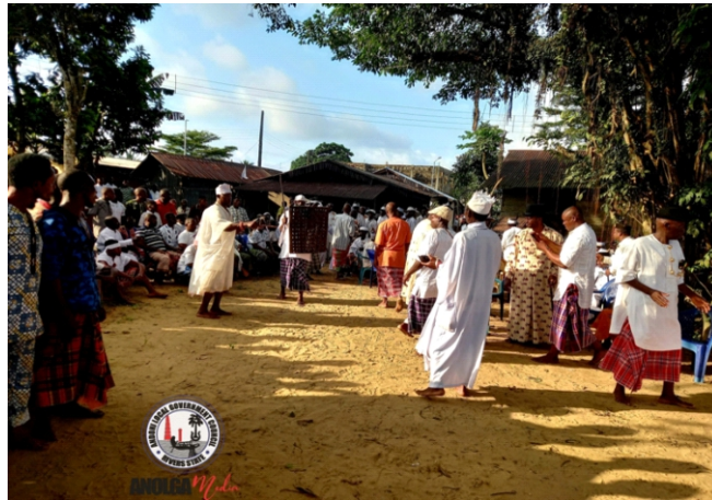
Figure 7: Some Chiefs and Elders performing their respective Rites/Roles during the Oath-Taking Rituals