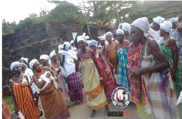
Figure 6: Old Women of Andoni performing some Rites before the Oath-Taking by the concerned/repentant youths